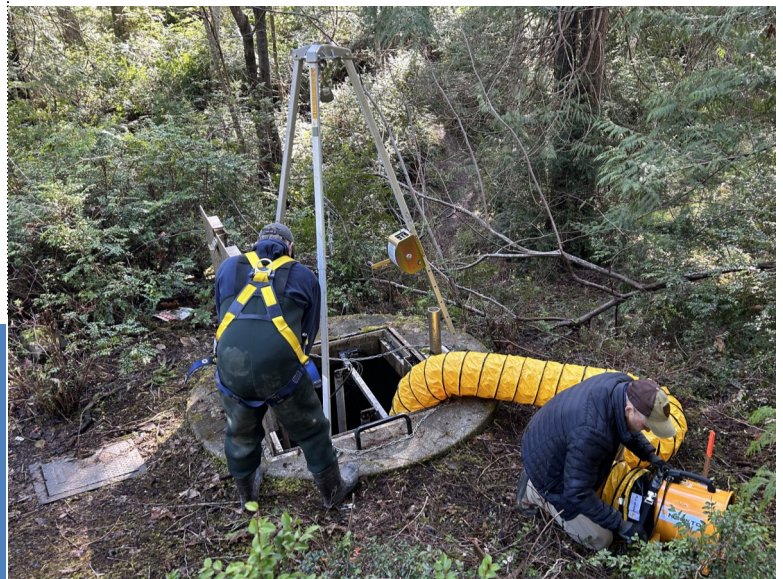
Kelly, left, assesses and prepares for confined space entry into the wet well at Lift Station #5, while safety equipment is installed and observed to be operating satisfactorily

There are more protocols for staying safe in confined spaces and certain circumstances require observing additional steps. At the end of the project, the crew safely and successfully completed the tasks, resulting in the repair of a backup pump and attachment of the chain to the other pump.